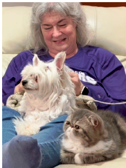
Knitting, a sweet new dog and a friendly cat - ah, the good life!