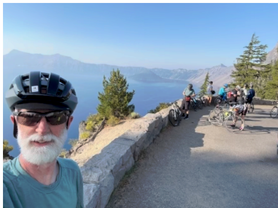
Biking around Crater Lake.