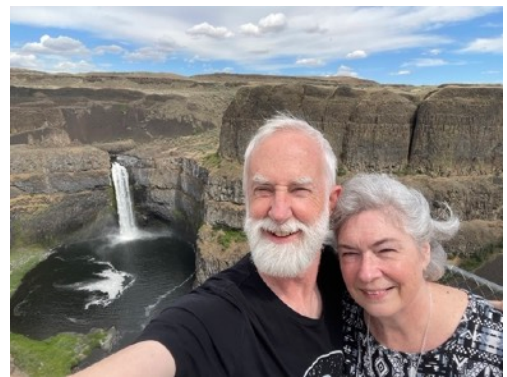
Palouse Falls, Shi Shi beach (below)