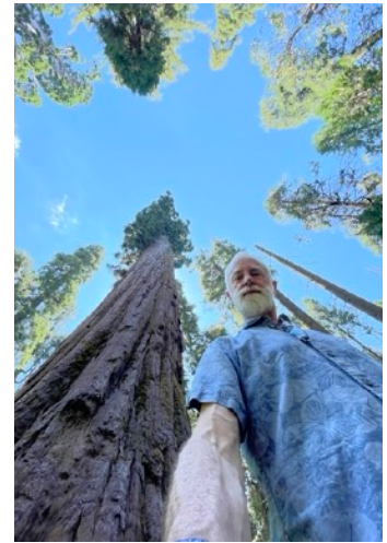
The massiveness of the trees at Big Trees.