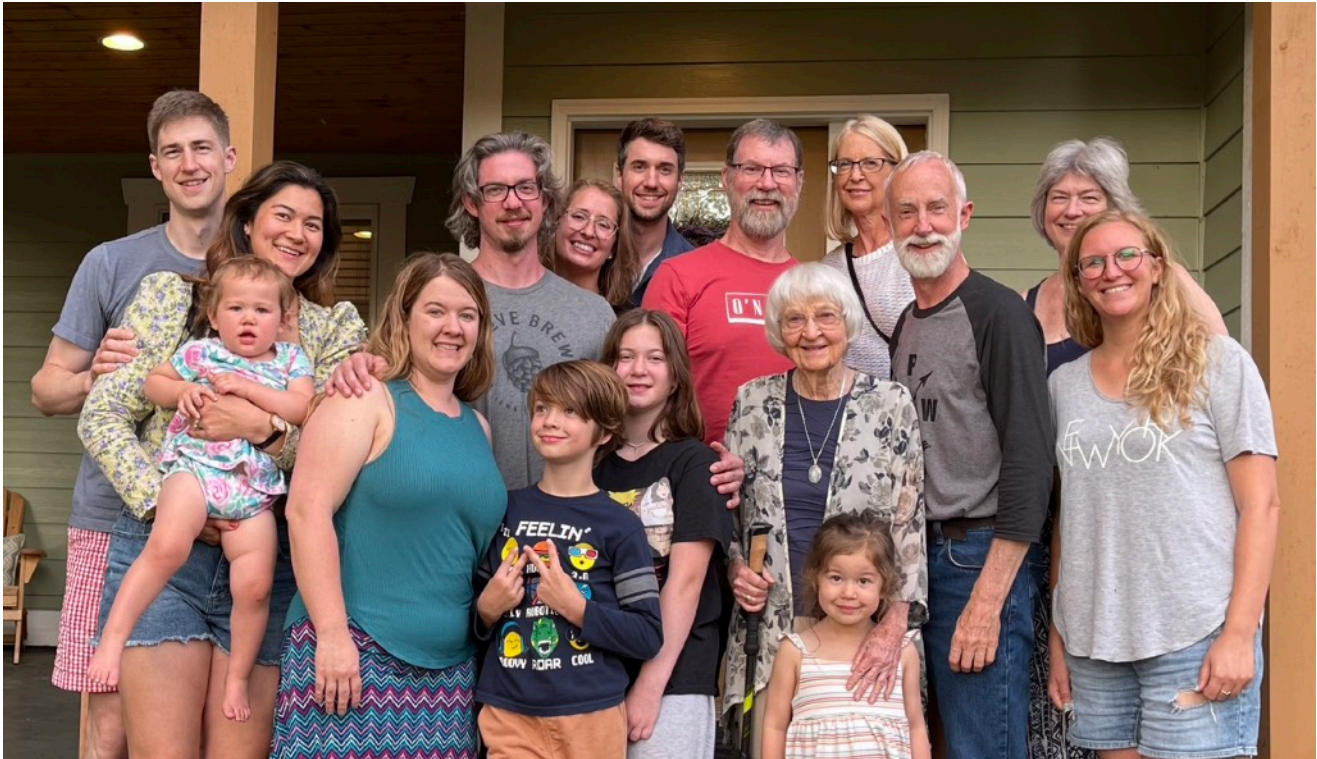
The whole family together at our summer airbnb.