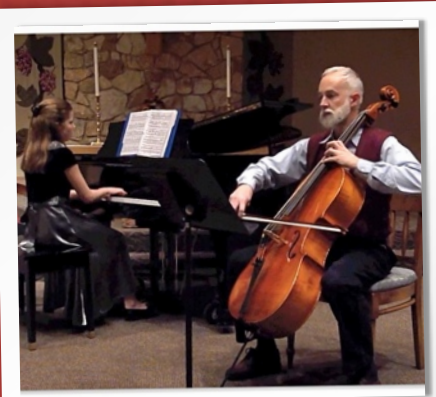
A MUSICAL CHALLENGE