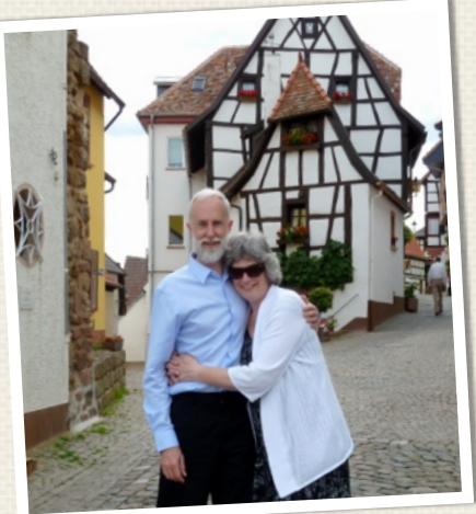
WE DID HAVE ONE BIG ADVENTURE – WE WENT TO GERMANY.

2011 has been a year of growth and progress for our family: