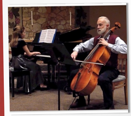
A MUSICAL CHALLENGE